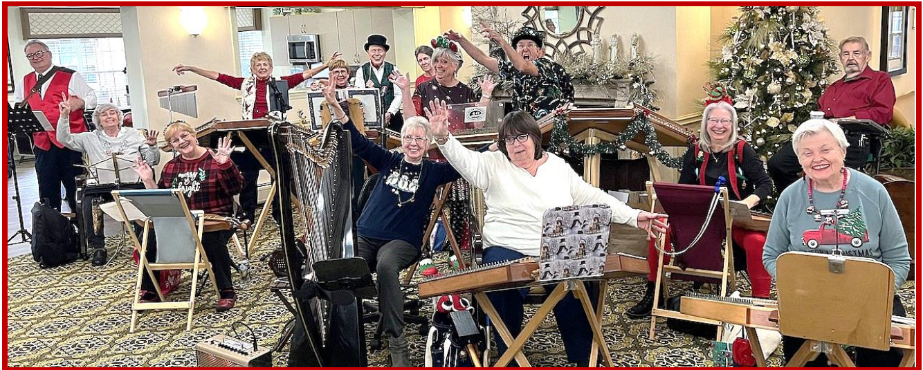
Let the music begin at Oakmont Senior Living in Livonia on December 10 th