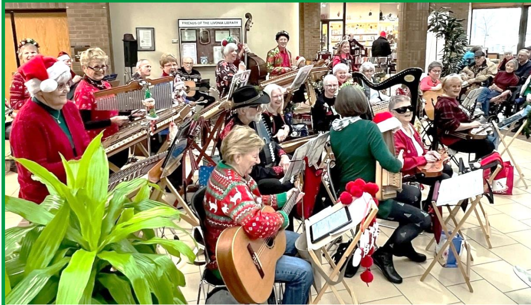
A large and enthusiastic audience greeted Silver Strings at the Livonia Library on December 19 th for our final Christmas Concert of 2024. Merry Christmas to all!