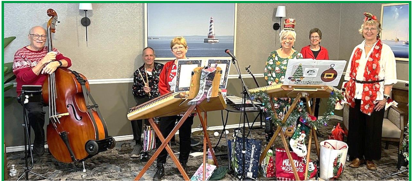
A select group of musicians performed for the residents of Waltonwood Senior Living in Livonia on December 12 th