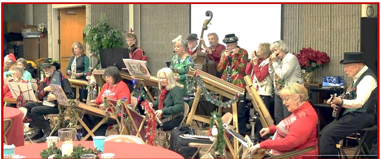
Another lively Christmas Performance took place December 14 th at Celebration Church in Westland.