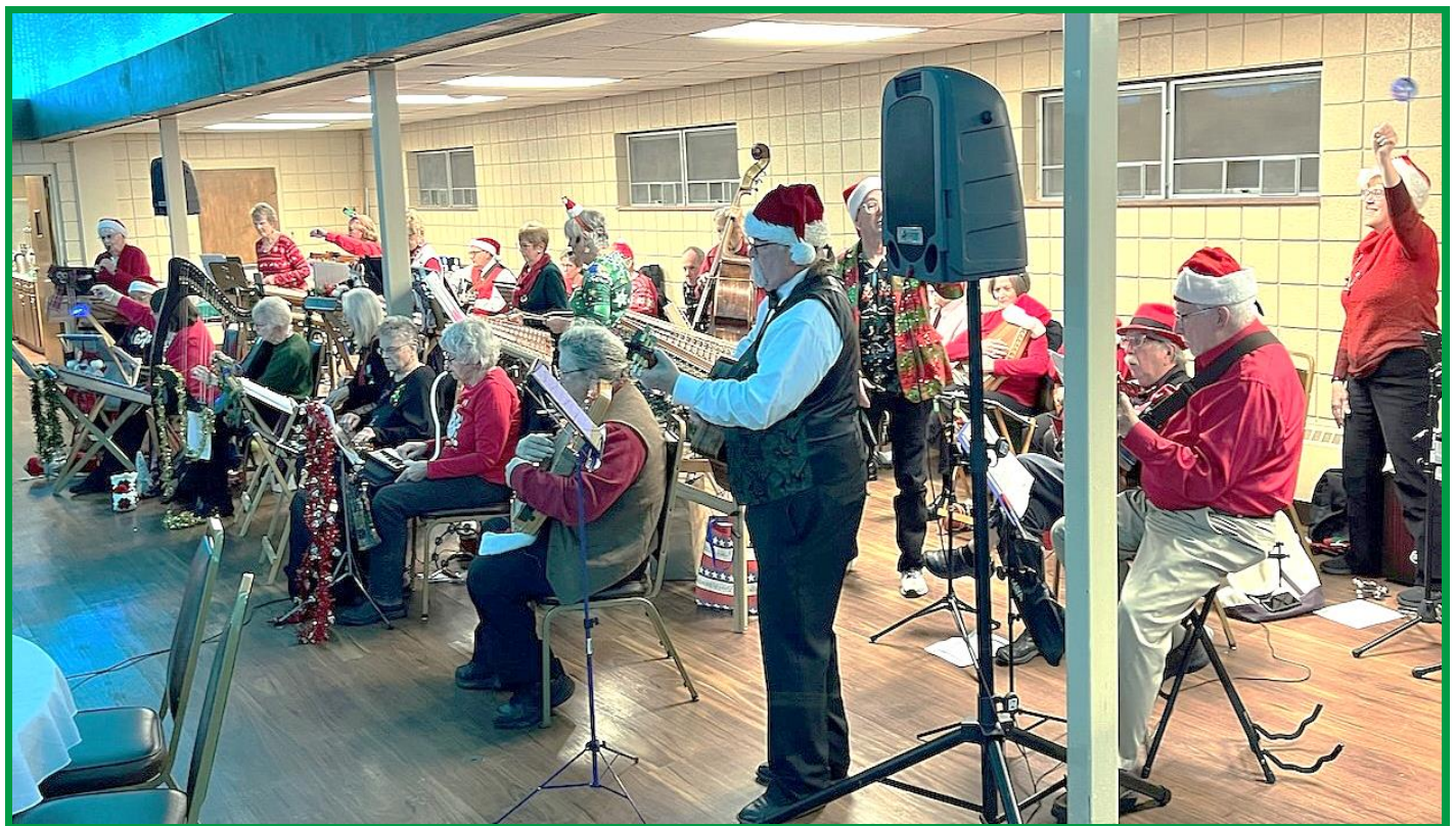
28 Silver Stringer's performed for the Holy Cross Church's Candlelight Dinner on December 3 rd Holy Cross Church in Livonia became our home meeting place in 2018. This was the first of 10 December Christmas Concerts. Let the Holiday's begin!