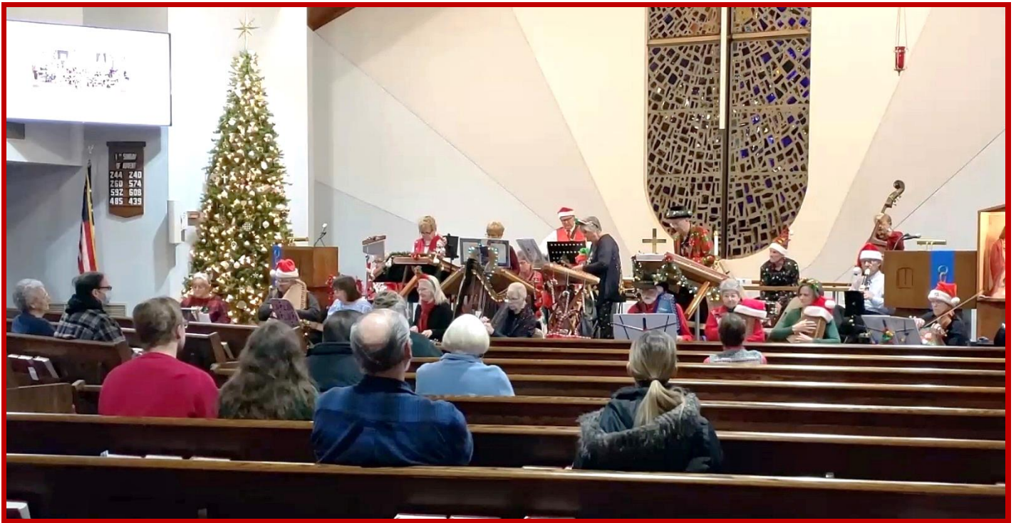
Silver Strings performed a Christmas Concert at Good Hope Church in Garden City on December 6 th . Good Hope Church was our club's home for 32 years (1986 - 2018).