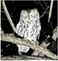
Eastern Screech Owl

Here we are in February gliding through another winter month. Soon our thoughts will be turning to warmer weather. In another month (March) we will be accepting reservations for our SSDS campout which occurs this year from June 4 through June 10. Once again we will be at the Oakland County park, Groveland Oaks for a week of comradery and music. Start thinking about the campout fun and plan your calendar accordingly. We will be letting you know the exact date reservations will be accepted. In the meantime, let's enjoy our jam sessions indoors on the first and third Thursday of each month.