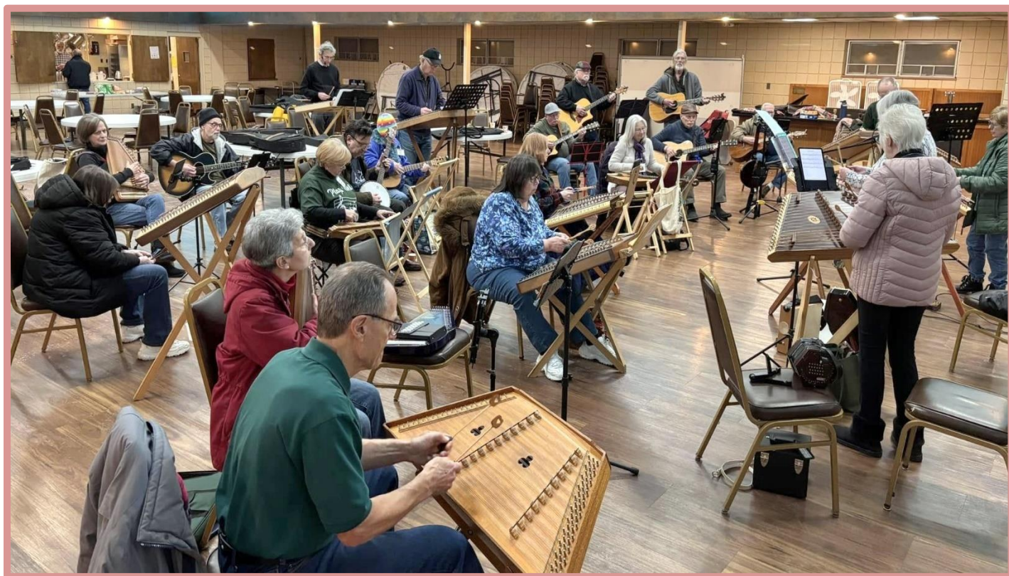
The heat was out at Holy Cross Church on January 16 th but that didn't stop 29 members from having a good time!