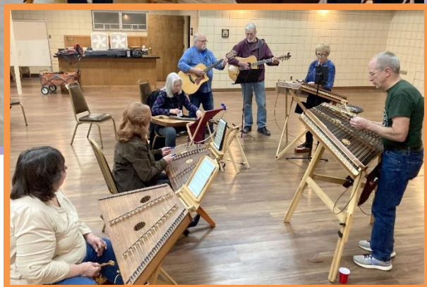
Our first jam of the new year on January 29 th brought out 29 members. After the jam we had lots of snacks and at 9 pm the "After Hours" jam started up. What fun!