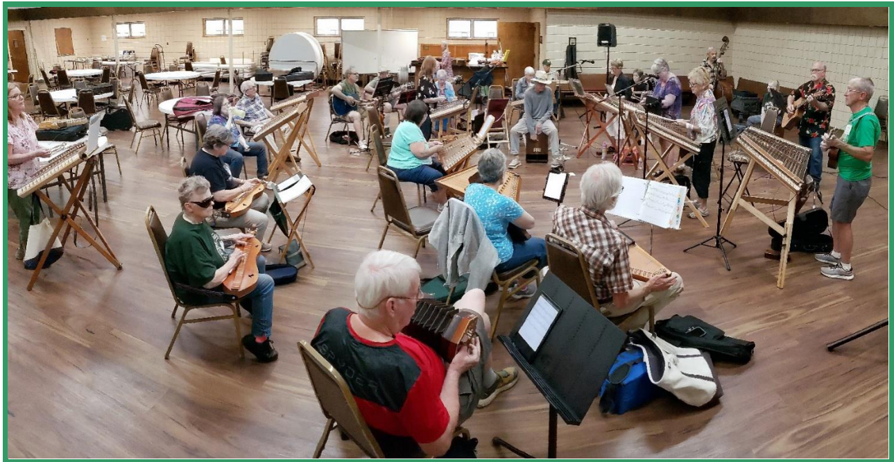
Our Silver Strings Jam on September 5 th brought out 31 members