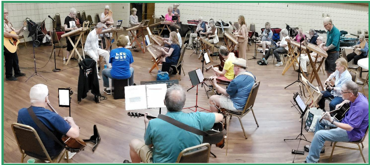
28 musicians attended our rescheduled September 12 th Jam