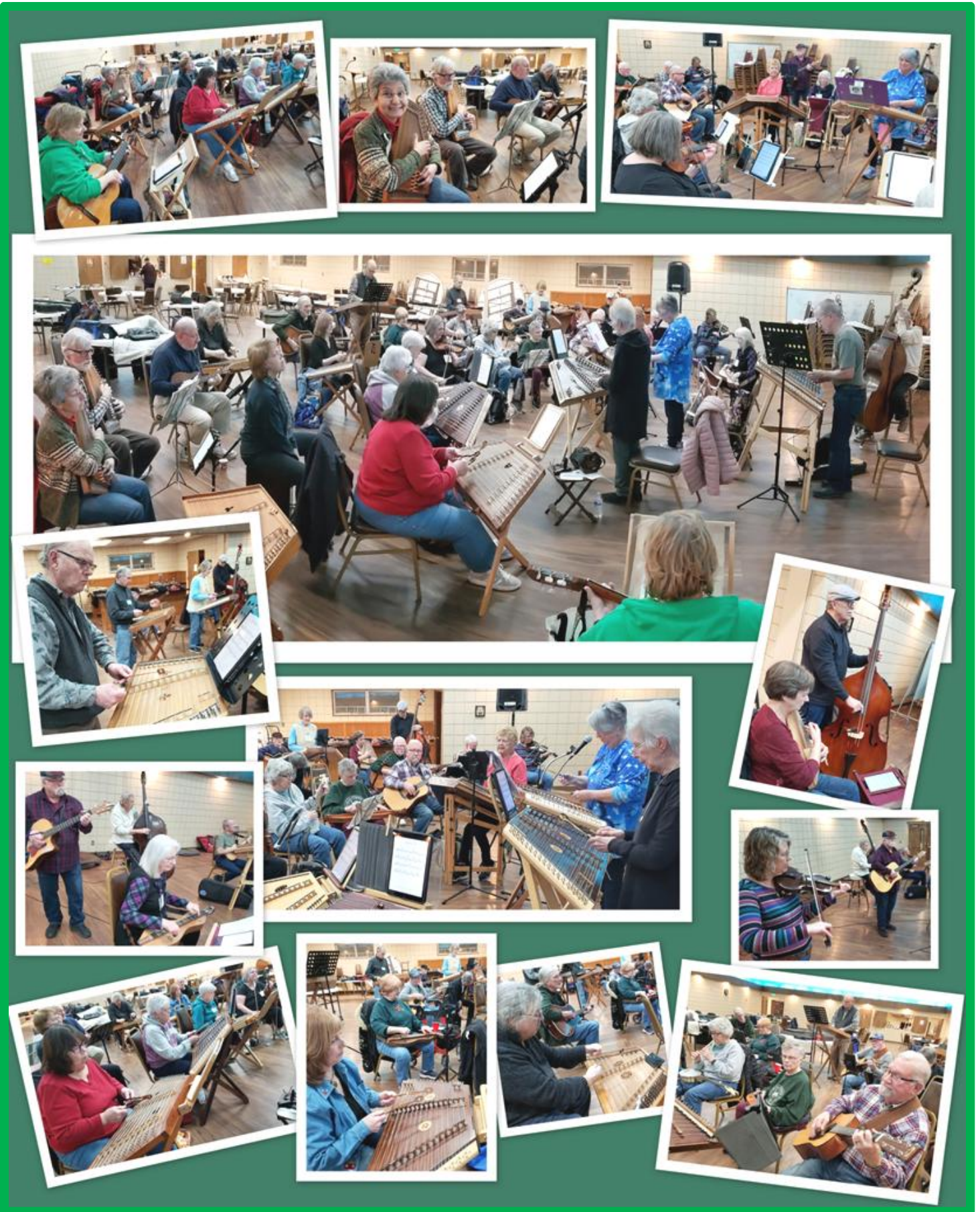
On February 15 th , 34 members enjoyed a full evening of music and fellowship and snacks. What fun!