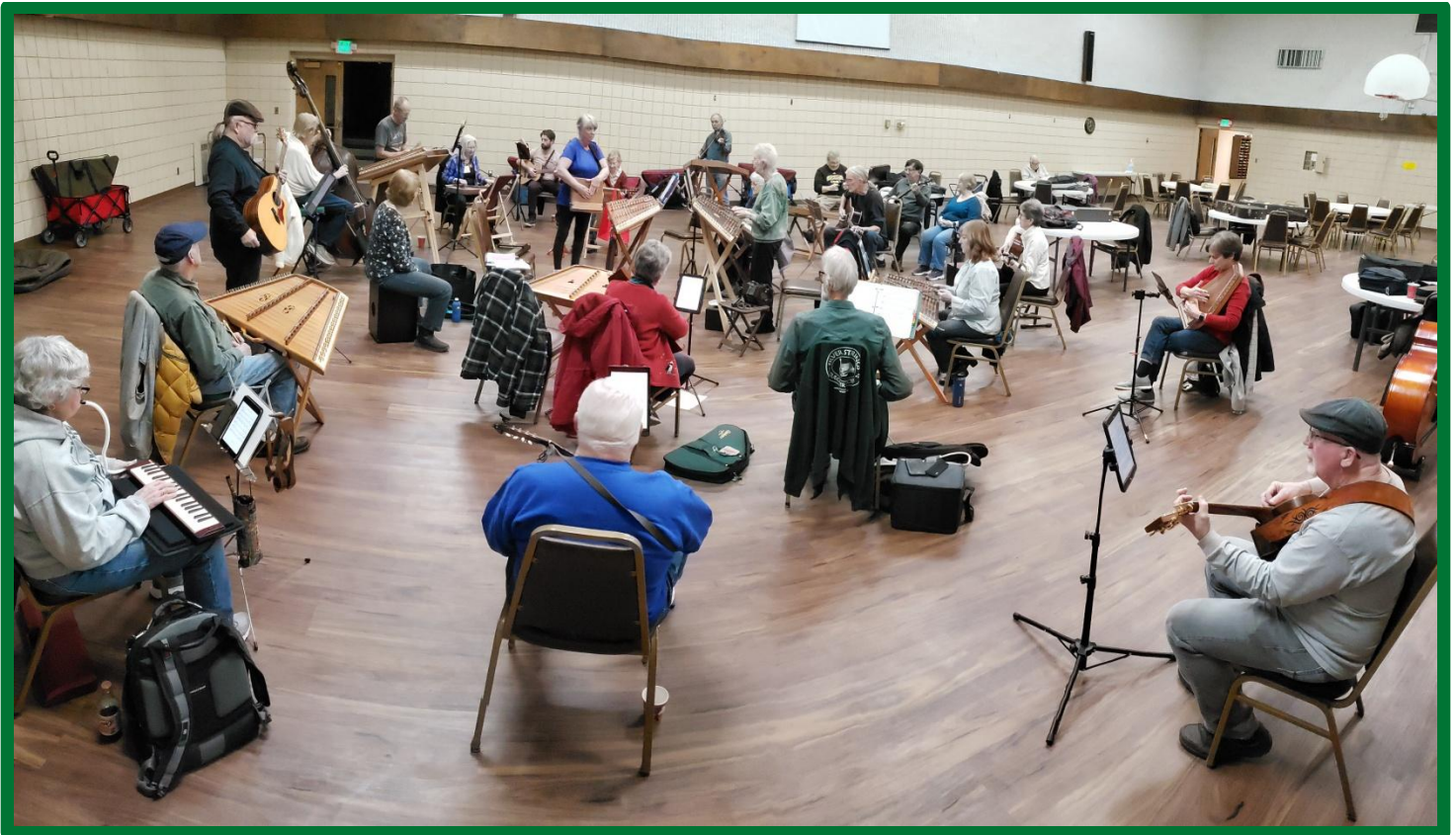
26 members showed up on February 1 st to play music and dispell the "Winter Doldrums".