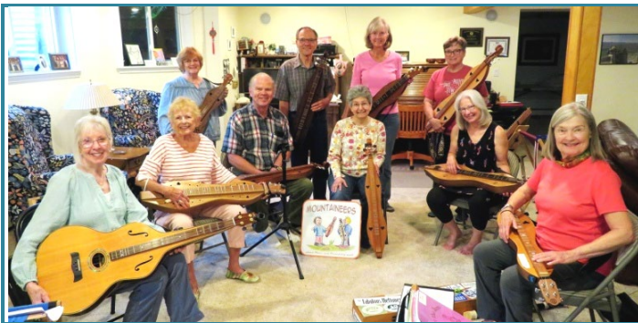
Mountain Dulcimer Group - Mountaineers

Check our website: https://ukulelegathering.weebly.com/