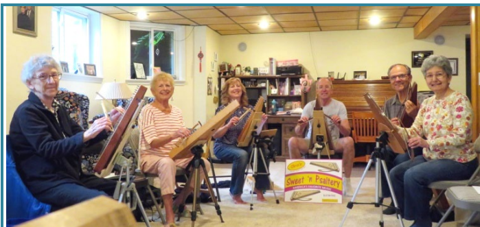
Bowed Psalterly Group - Sweet 'n Psalterly

The Mountain Dulcimer & Bowed Psalterly groups will be taking a break until October.