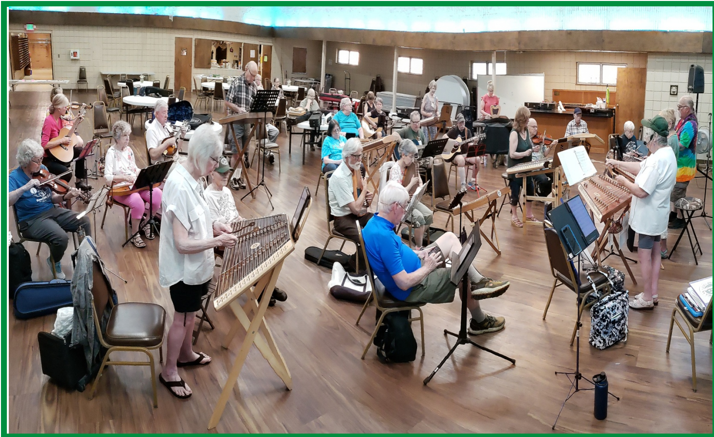
30 members and several guests attended the June 20 th Jam at Holy Cross.