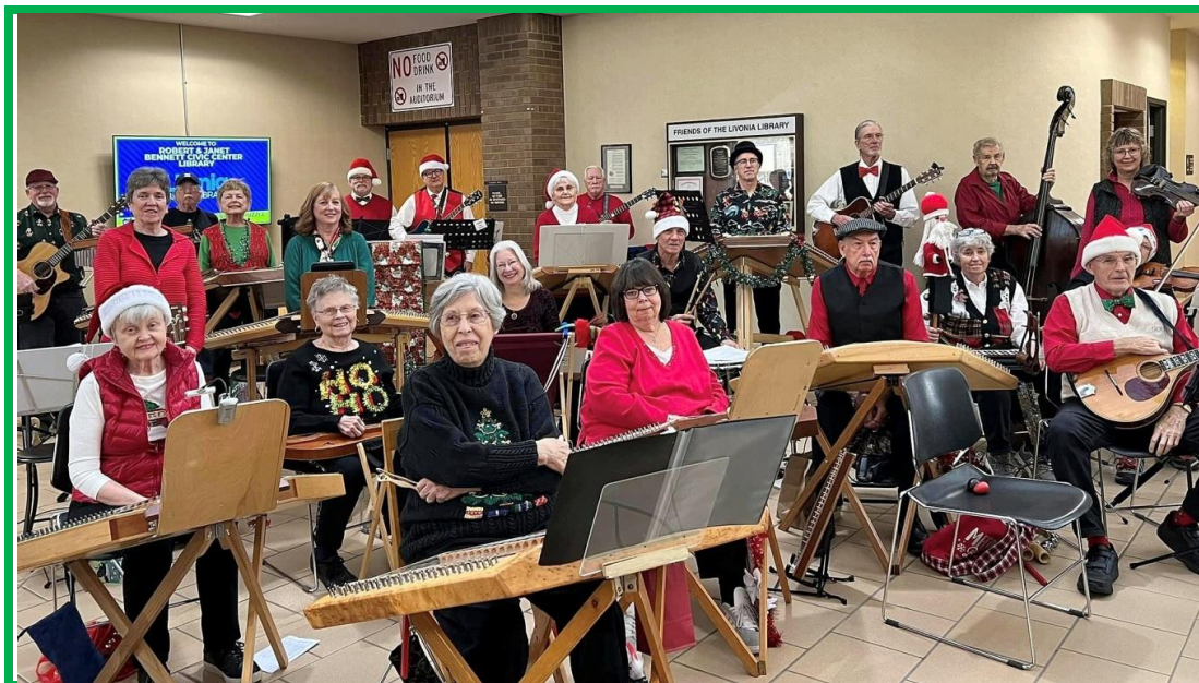
The 11 th and final Holiday performance has become a yearly tradition at the Livonia Library. 23 Silver Stringers performed for a standing room audience on Dec 21 st .