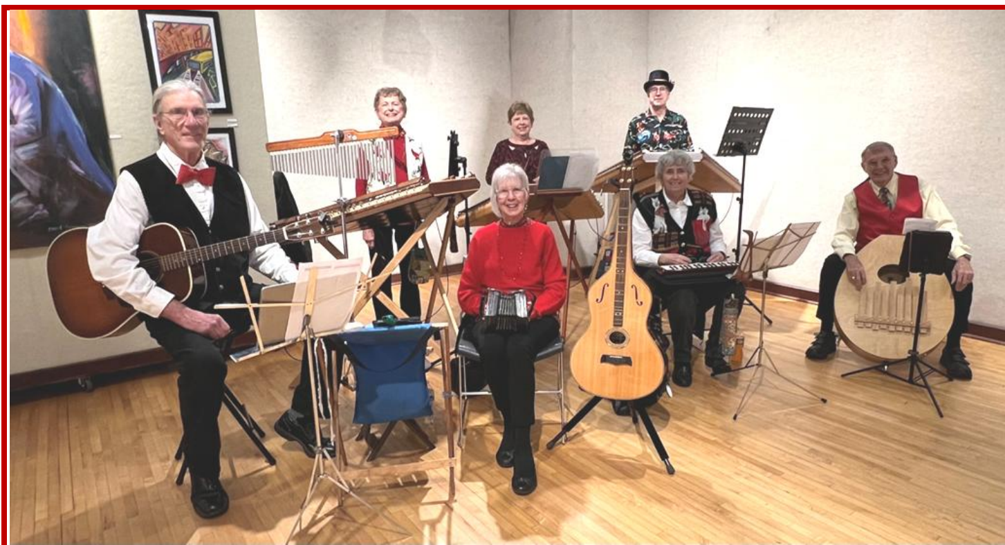
The Padzieski Art Gallery at the Ford Community Arts in Dearborn hosted Silver Strings on December 3 rd .