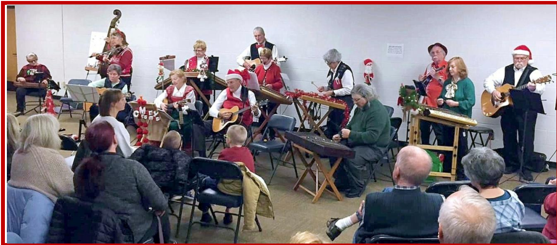
The Southgate Library brought the community out for a Holiday Concert on December 18 th .