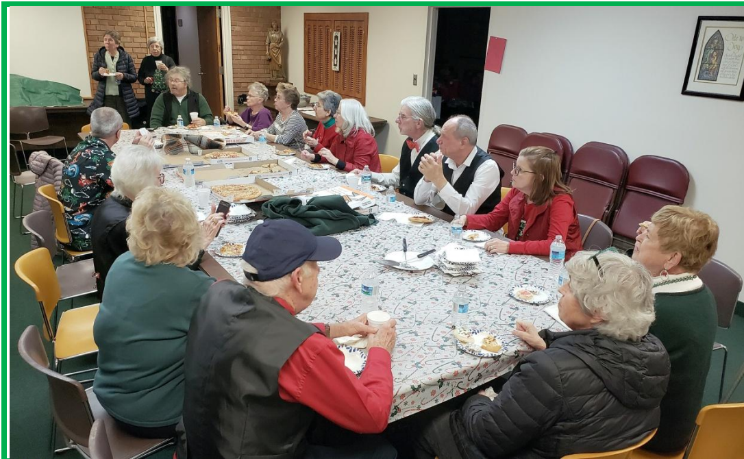
After the St. Richard performance, a generous afterglow was provided for the musicians with pizza and lots of Holiday desserts.