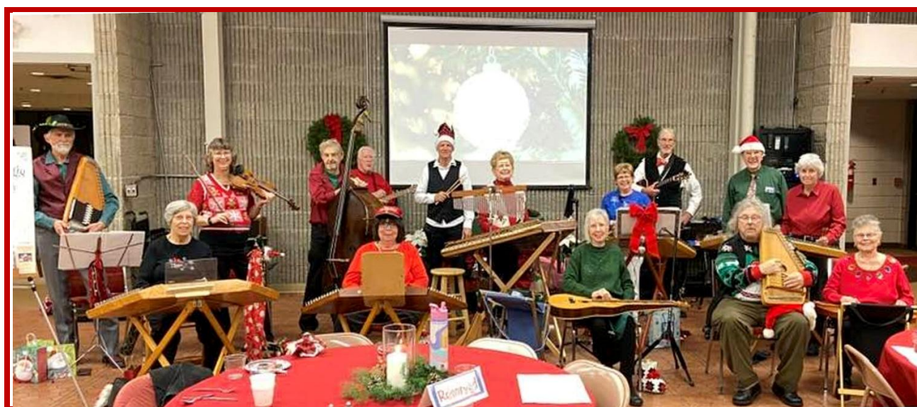
15 members performed at the Celebration Church in Westland on Dec 9 th