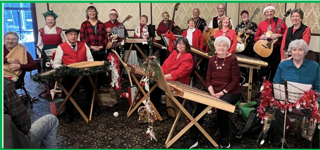
The 17 performers were all smiles at the St. Mary's Cultural Center performance on Dec 13 th .