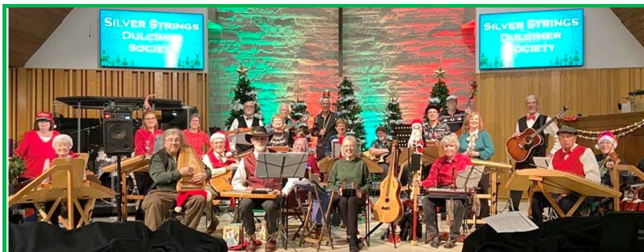
Silver Strings 5 th Holiday performance took place at Newburg United Methodist Church Dec 8 th .