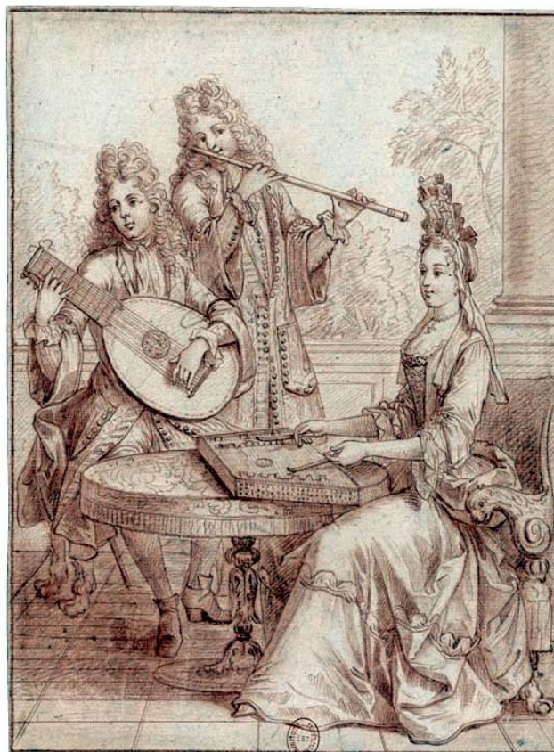
Symphony of Tympanon, Lute and Flute.

https://www.facebook.com/profile.php?id=100054339048511