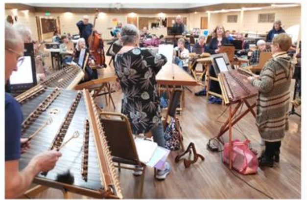
The first Silver Strings jam of 2024 took place on January 4th. 37 members (and 2 guests) showed up for a fun filled evening of music, socializing and snacks.