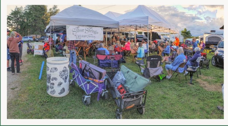
Lots of well attended Jamming took place at the Silver Strings music site.