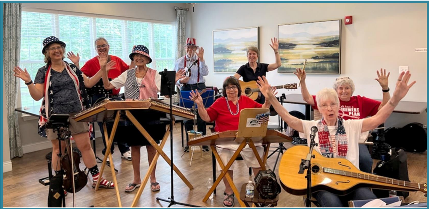
Happy Silver Stringers performed at Addington Place of Northville on July 2 nd .