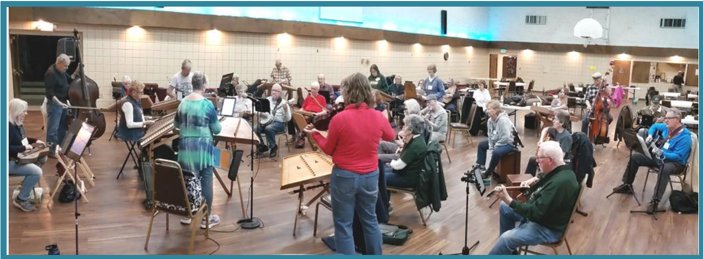
37 musicians attended the March 7 th Jam