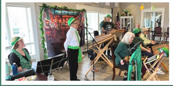
March was "Irish Month" with 3 Silver Strings playdates in Farmington, Brighton and Northville.