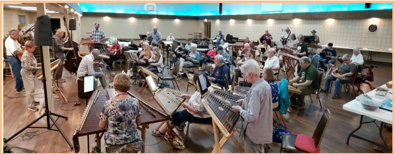
The September 7 th Jam brought out 41 members for a lively evening of music.