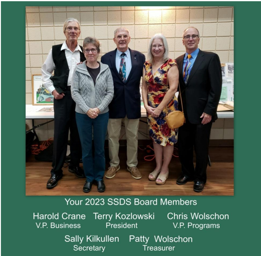
Your 2023 SSDS Board Members