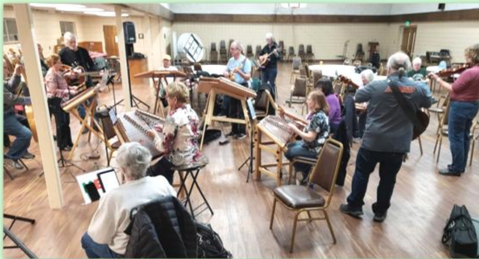
15 stayed later for the 'After Hours' Jam