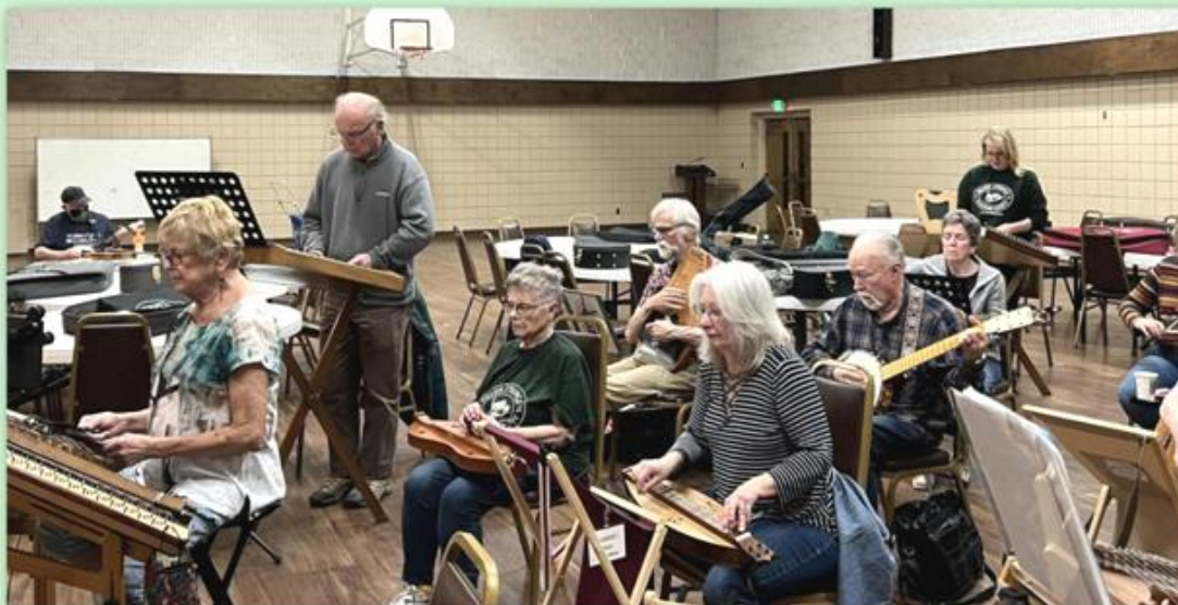
The April 20th Jam brought out 38 members for a fun filled evening of music.