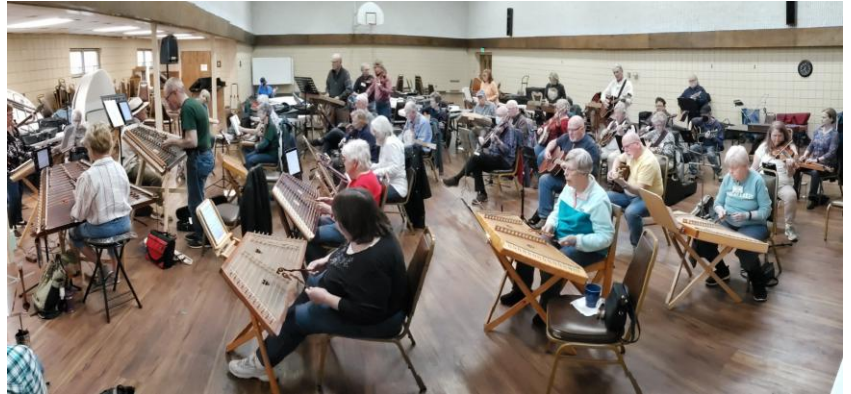
A really big jam with 44 musicians took place on May 4 th