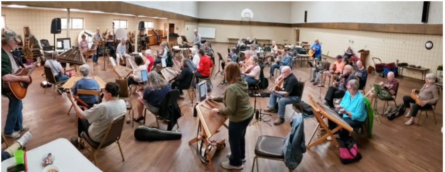
Wow! A new record attendance of 45 musicians at our 2nd meeting on May 18 th