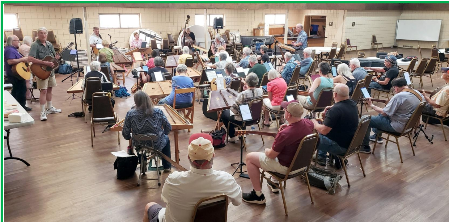
Our June 1st Jam brought out 36 musicians