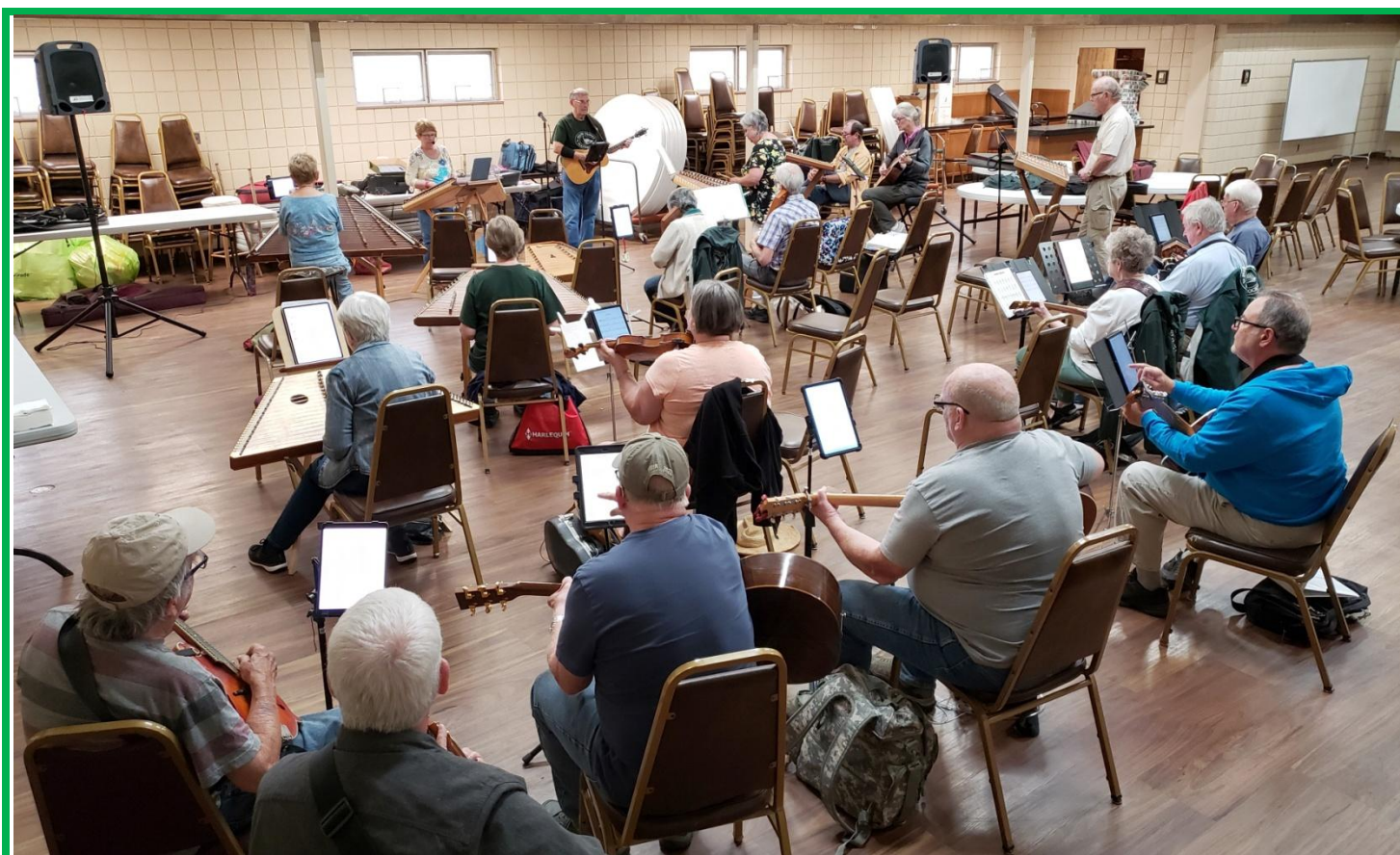
23 members jammed the night away on June 15