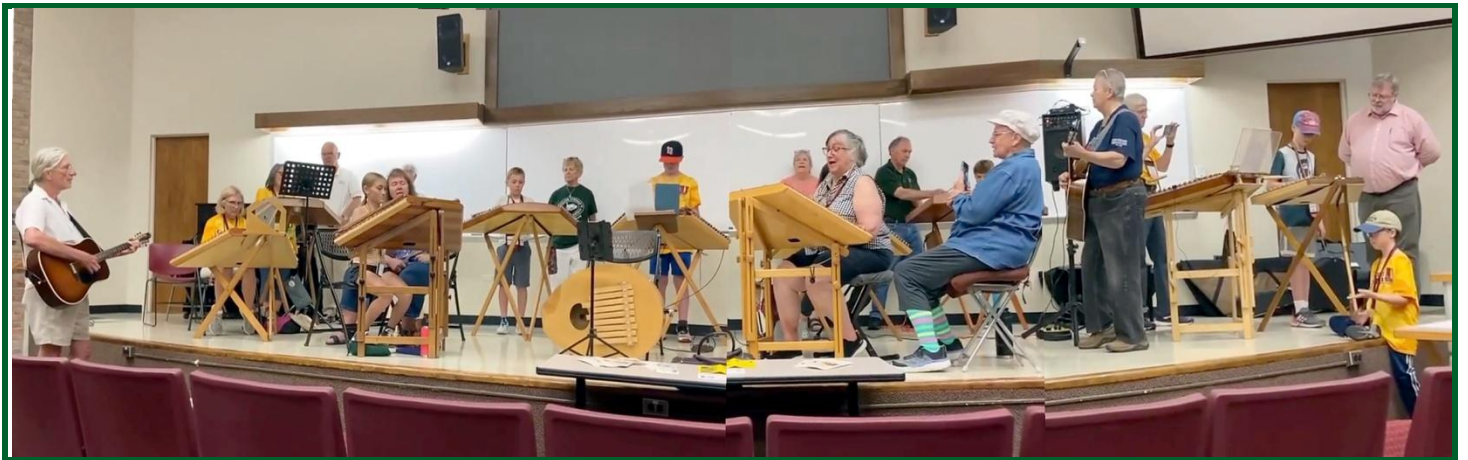
June 21st brought out fun at CMU Grandparent's Day where both grandparents and their grandchildren learned how to play the merry tune about a farmer who had a dog...That's right...BINGO was his Name-O!