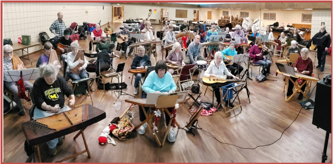
The final Christmas practice took place on November 9 th and was well attended by 39 members!