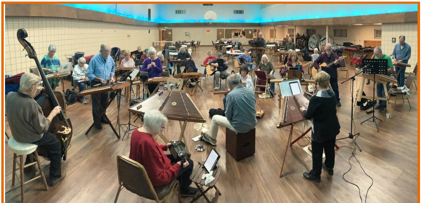
The November 9 th jam brought out 31 musicians and we shared music, snacks and socializing.