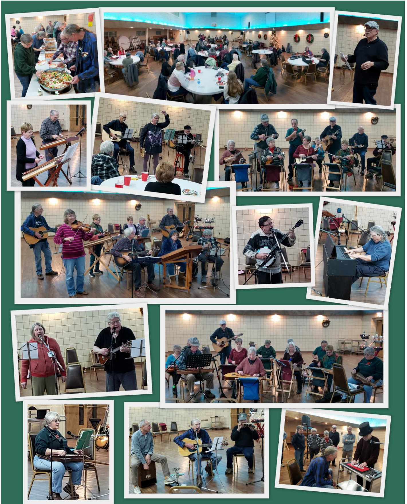
The final Variety Night of 2023 took place on November 30 th . The evening started off with pizza, Carol Ann's amazing salad and desserts followed by a full evening of entertainment, from individual performers to large groups. The first Variety Night of 2024 will take place on February 29 th , so practice up a tune or tune and we'll see you there!