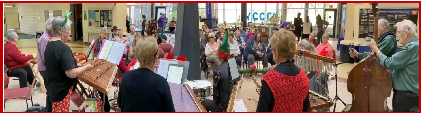
The first Holiday concert took place on November 15th at Wayne County Community College in Taylor