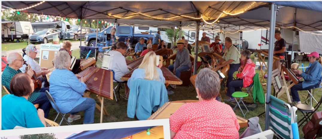
Lots of good day and evening jamming to place under the Silver Strings canopies.