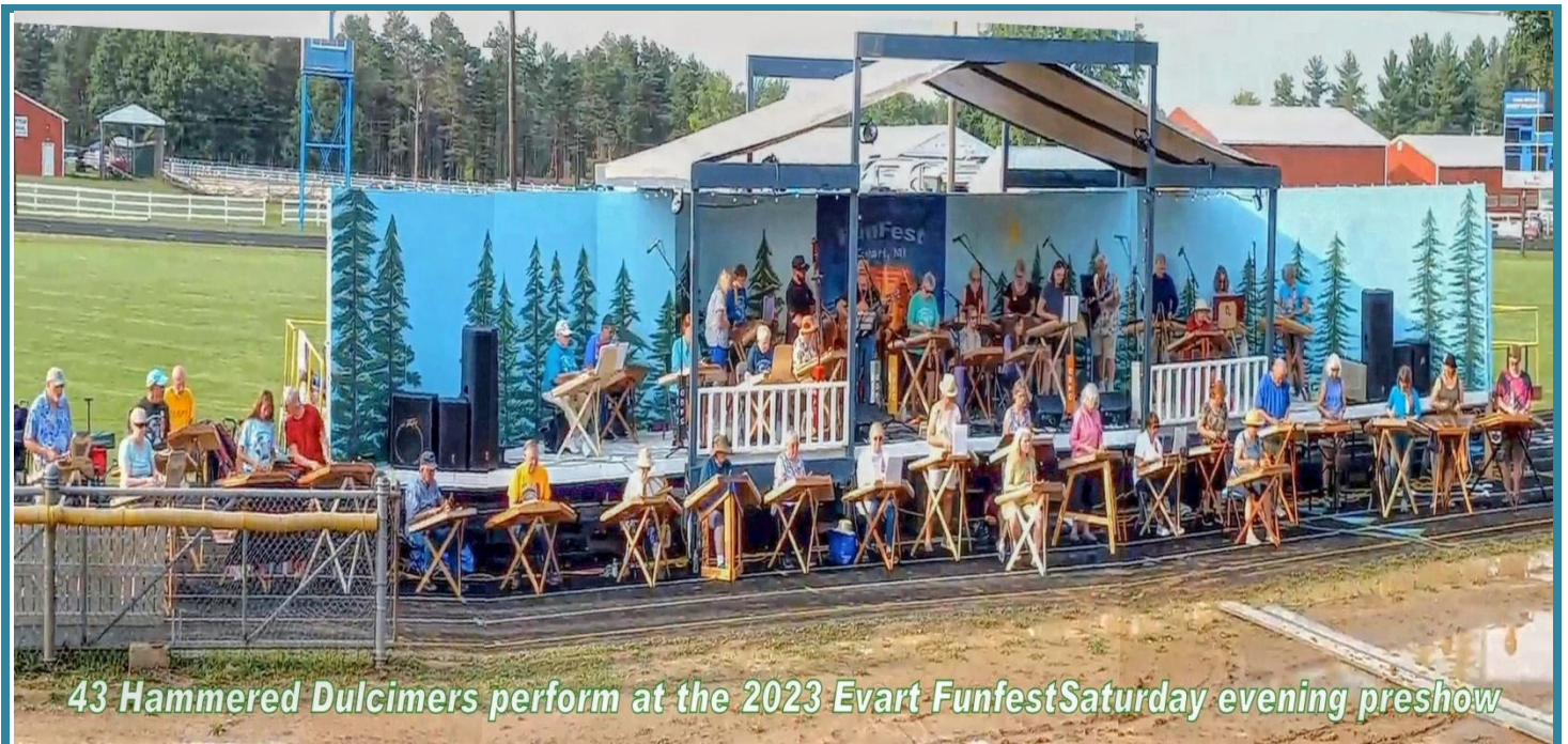
43 Hammered Dulcimers perform at the 2023 Evert Funfest Saturday evening preshow