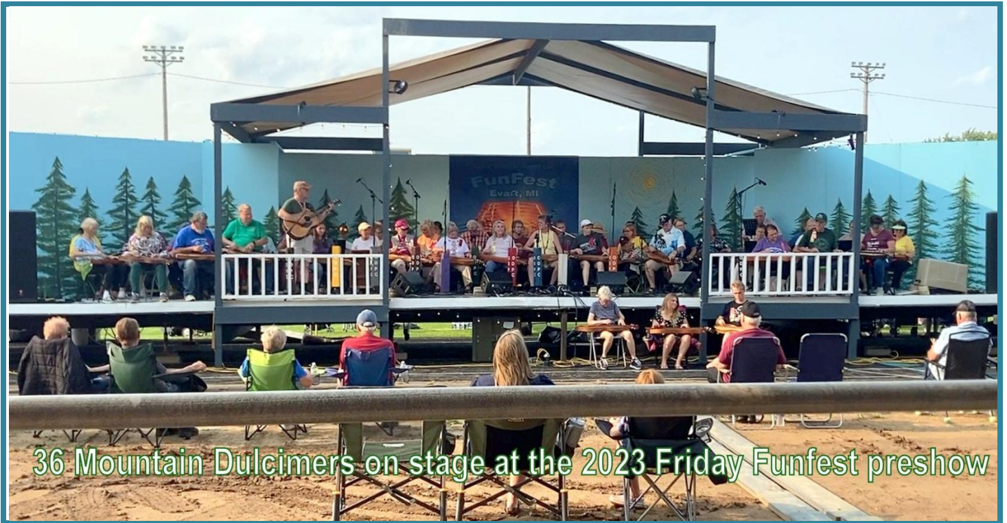
36 Mountain Dulcimers on stage at the 2023 Friday Funfest preshow

The 2023 Evert Funfest was a lot of fun this year. The weather mostly cooperated with cooler than usual temperatures, a little rain and no severe storms. The Friday and Saturday stage shows were preceded by an all Mountain Dulcimer preshow on Friday and an all Hammered Dulcimer preshow on Saturday.