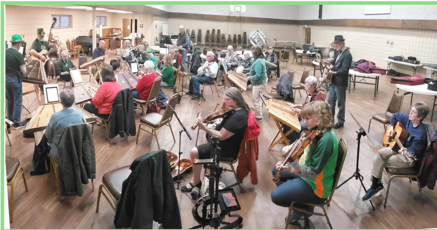
29 members attended the March 16th 'St. Patrick's' Jam at Holy Cross