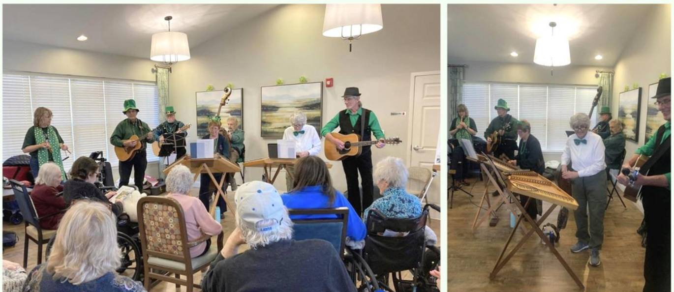
A lively performance by Silver Strings took place on March 15 th at Addington Place in Northville.