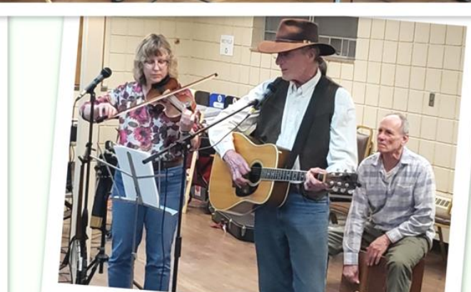
44 attended the March 30 th Variety Night for a full evening of food, music and fun. Join us again on June 29 th for another evening of musical entertainment.