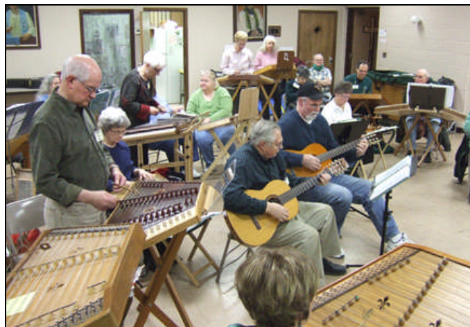
Two sides of the same room show a good turnout for a late winter jam.

Call us for details (734-663-7974) . . . . . Bob Hlavacek