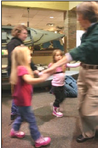
Erie dancers in action.