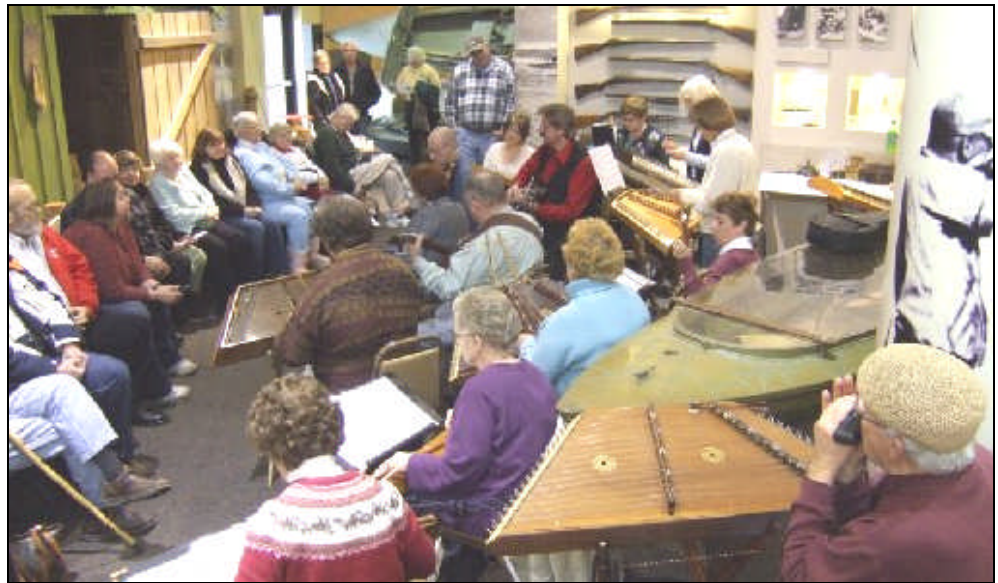
in our little corner of the world.