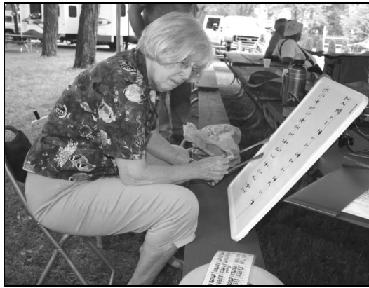
Preparing for her very first workshop, ever.