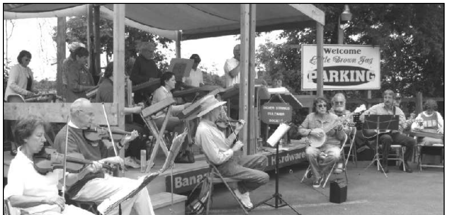
Small town festivals are lots of fun... like this one we played in Maybee, Mich.