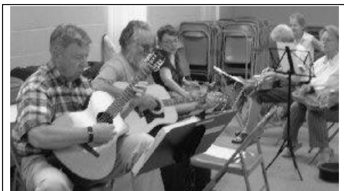
The workshops before the August 16 th jam were well attended. After learning the songs separately, we sounded quite good together. It was a good format.