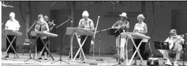
SILVER STRINGS SOUTHERNERS

When do wild oats turn to prunes & bran ?