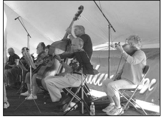
While we played at the Old St. Patrick's Labor Day Festival, adults and children danced to the tunes. A good time was had by all, and we were invited back for next year.