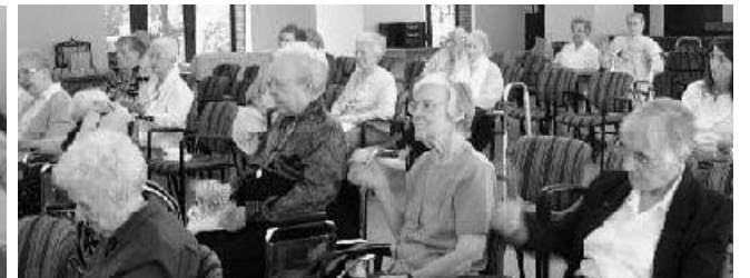
Entertaining the retired nuns at a convent in Monroe brought lots of smiles and participation.