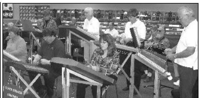
We had a good turn-out for Border's book store. We played well together while enjoying our unique surroundings.