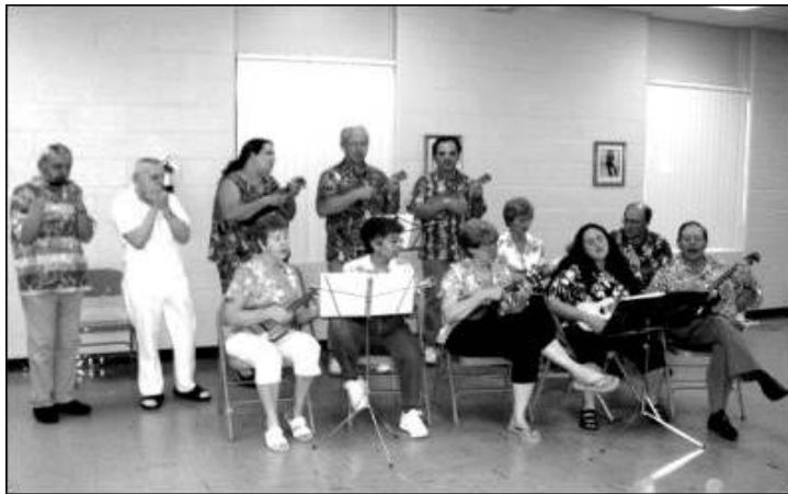
Uke & sing