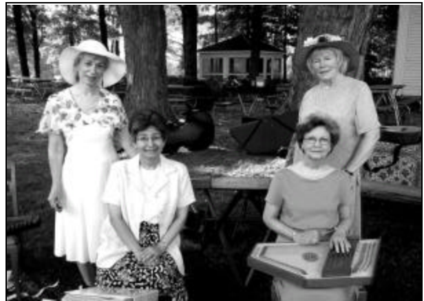
The Ladies dressed up for evening tea