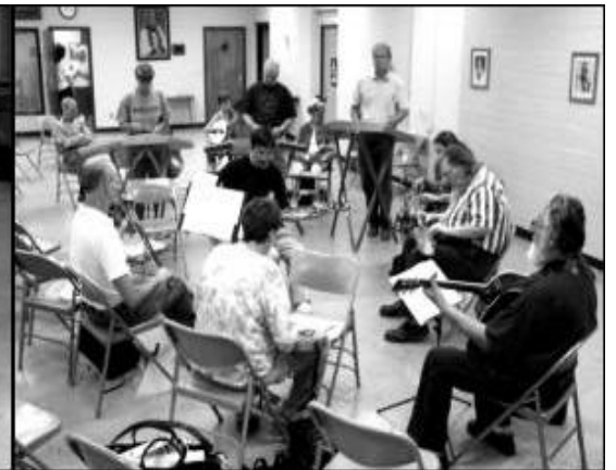
The Open Jam

Seven acts performed at the June 30 Variety Night and entertained a large audience. After the entertainment we were treated to pizza, and an open jam followed. The next Variety Night will be September 30 so practice up on a tune to perform, or stop by to enjoy the entertainment.