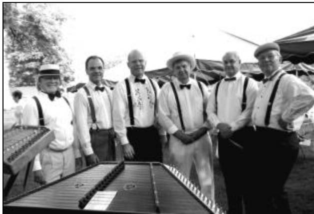
The Gentlemen – wearing their old-fashioned finest

On July 12, Silver Strings performed at Greenmead Historical Park for an evening High Tea. It was a very hot and humid day as we arrived at the grounds and set up in the shade of a giant oak tree. However, as a gentle breeze drifted through the park, we soon realized that the day was about to turn into a beautiful summer evening. We were encouraged to wear summer dress up outfits for this somewhat formal affair. As the gracious staff began to provide the tea and finger foods to the guests, we provided background music for the occasion. Silver Strings provided 3 sets of music from 7 until 9 pm and between each set, we were invited to participate in the evening refreshments. The evening activities ended just as the sun began to set. Thanks go to George Gonyo, Bob and Dorothy Ewald, Roger and Barb Davis, David and Theresa Smith, Ramona and Steve Hadley and Bob Hillavacek.