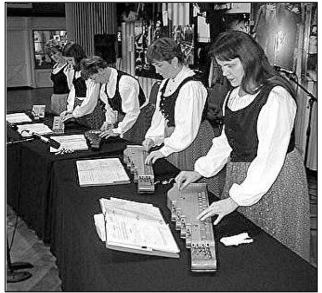
The Szikra Ensemble in performance.

Several of our older songs have been requested at the regular jam sessions, but we don't seem to do well with them. I will pick a song at each jam, and we will play it several times, so we become familiar with them.